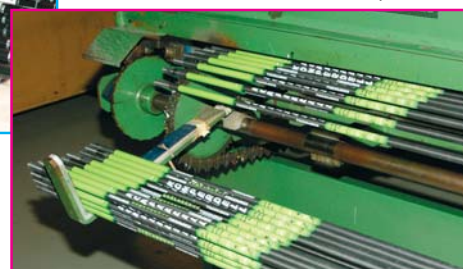
Production of poles from recycled aluminium